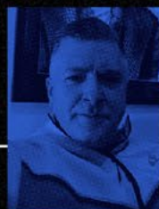
MARK LISTINGS AND PARTNERSHIPS DIRECTOR